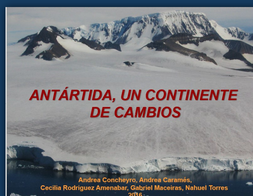
Some of the workshops and conferences titles developed for high school students and their teachers.