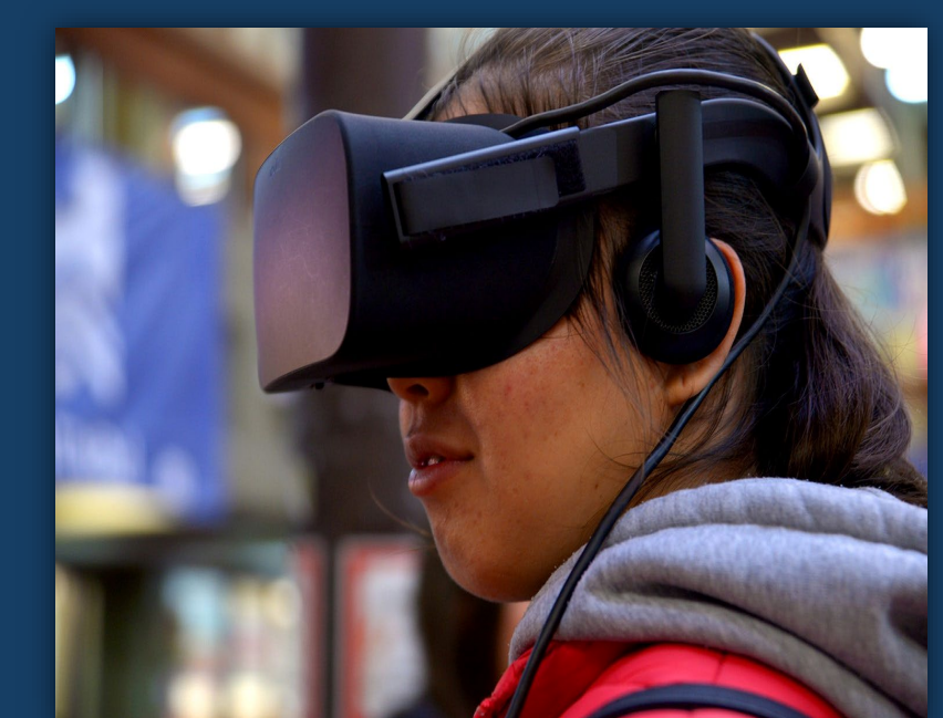
A more updated display of the Antarctic camps, observation of rocks and fossils under the magnifying glass, presentations of software for geological mapping and oculus for advanced all-in-one Virtual Reality of the Marambio Base area, as part of a cooperation project with Universidad de la Defensa, Argentina.