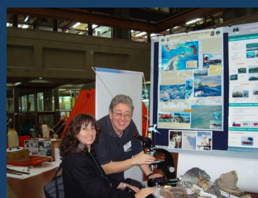
The target audience included university and high school students, as well as children from the kindergarten run by the university, families of university staff and passers-by. Professors preparing petrographic thin sections to explain to the community about igneous rocks, volcanism and its genesis, about sedimentary rocks and fossils found in Antarctica.