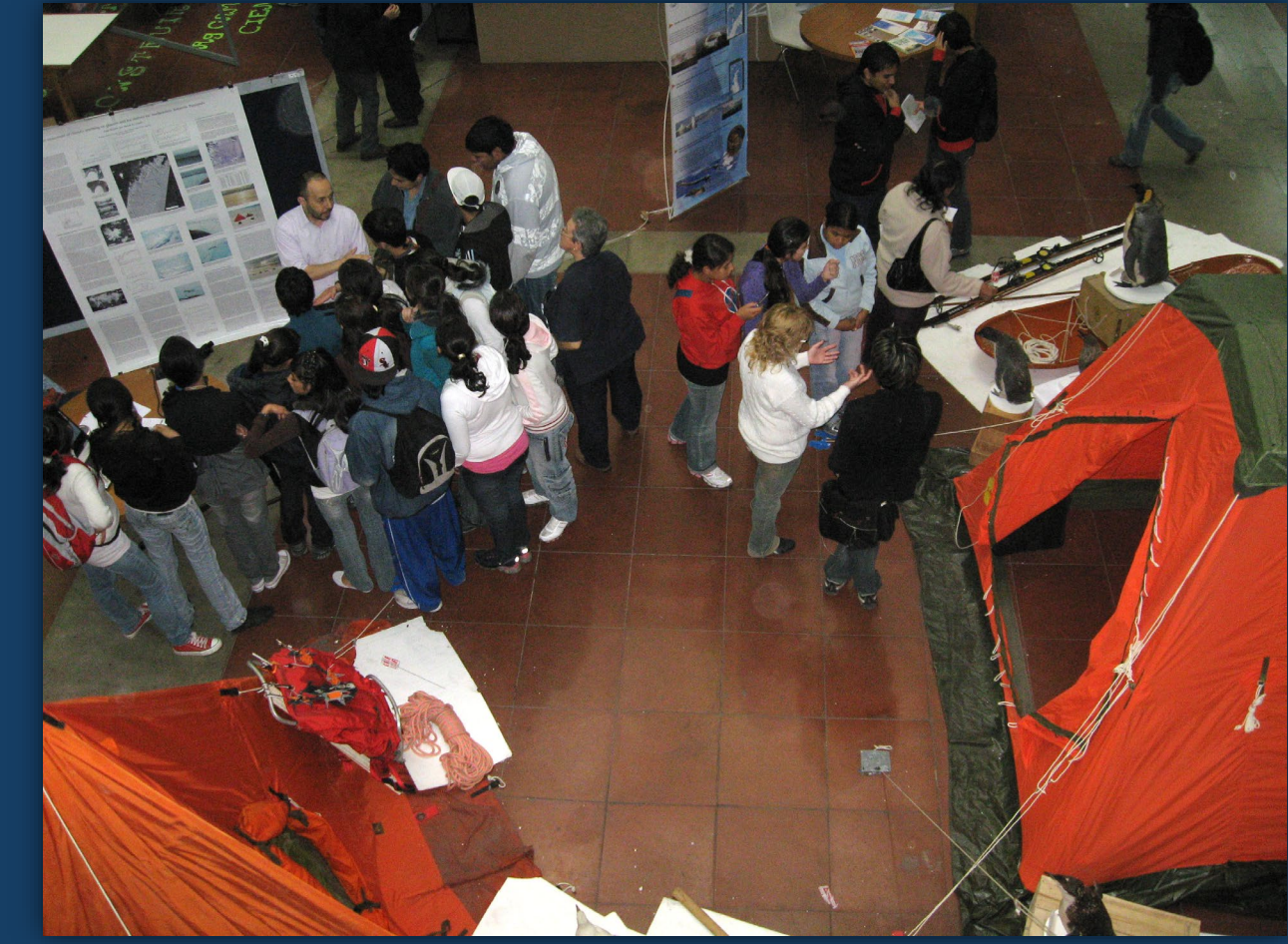
Panoramic view of the Central Hall of the Facultad de Ciencias Exactas y Naturales, UBA, during the Earth Sciences Weeks, in one corner the Antarctic camps stand, plus a close-up view of the tents, ropes, sleds, penguins and also some posters and maps exhibited to explain to students and passers-by in general.