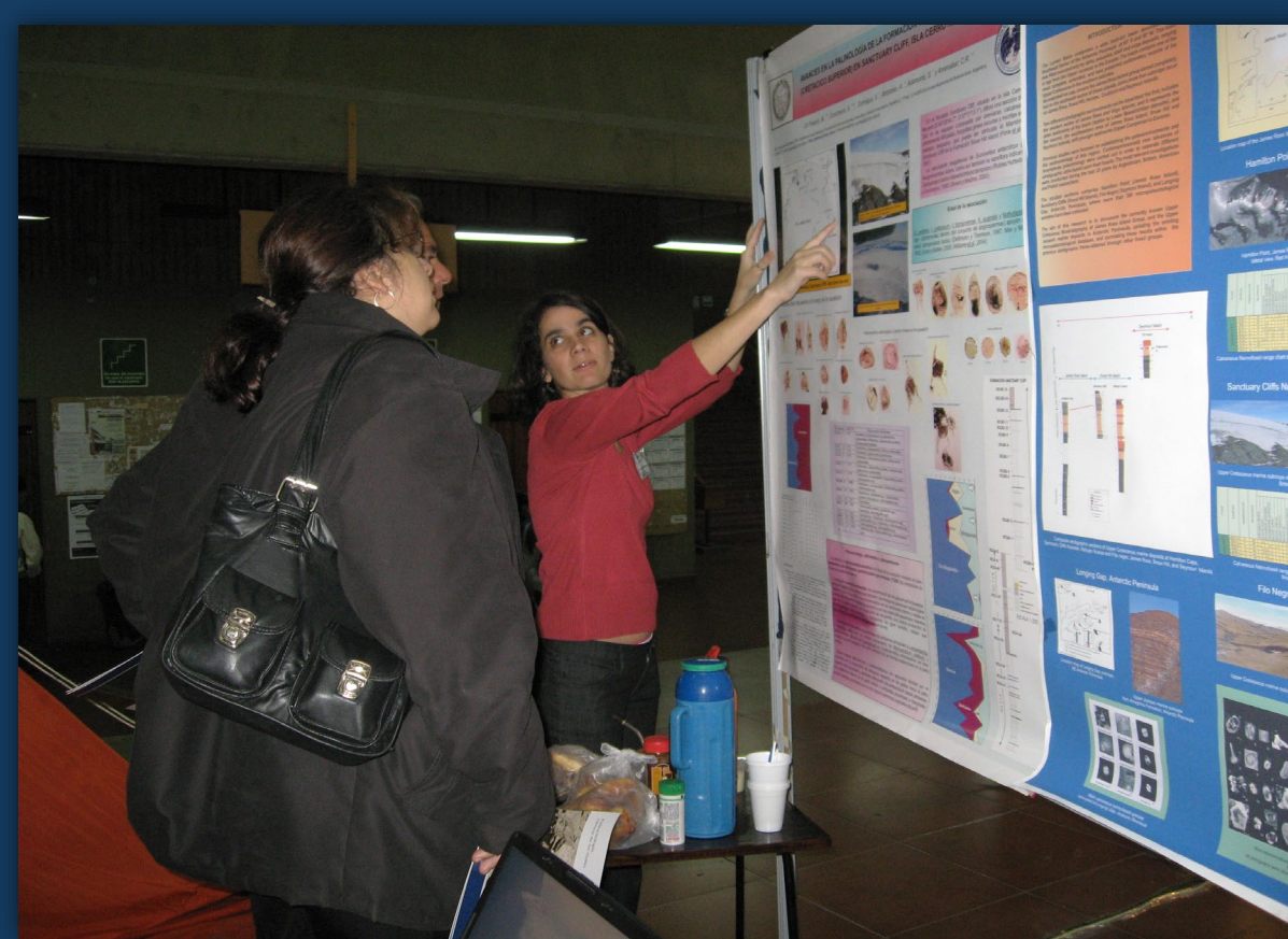
Hand-sampled rocks and petrographic sections were added for observation, as well as Mesozoic and Cenozoic fossils collected on expeditions in the James Ross Basin, northeast Antarctic Peninsula. Maps, geological sheets and posters pointing out the lines of research in geology and palaeontology.